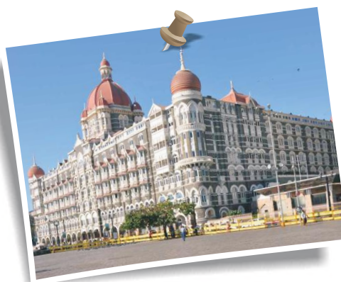
2019 – Mumbai